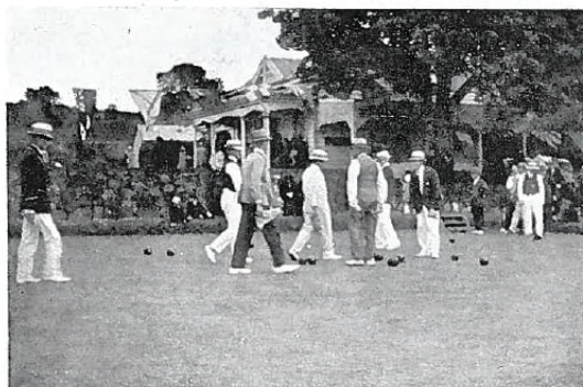
First Pavilion, Allendale Road