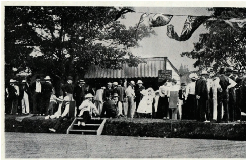
Opening Day 1897

The club hired their first Greenkeeper for 15 Shillings a week. Two rinks were laid in, and eventually the inaugural opening day for the new club arrived on October 23rd, 1897. The first members paid a subscription of One Guinea.